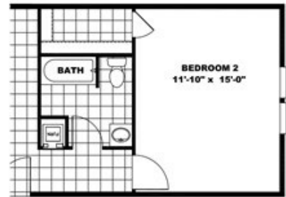
OPTION 2 BEDROOM

Our home building facilities invest in continuous product and process improvements. Plans, dimensions, features, materials, specifications and availability are subject to change without notice or obligation. Renderings and floor plans are representative likenesses of our homes and may differ from the actual homes. We invite you to tour a Home Center near you and inspect the highest value in quality housing available or call (865) 933-3495 to speak with a Home Consultant. Copyright 2017, CMH. All rights reserved.